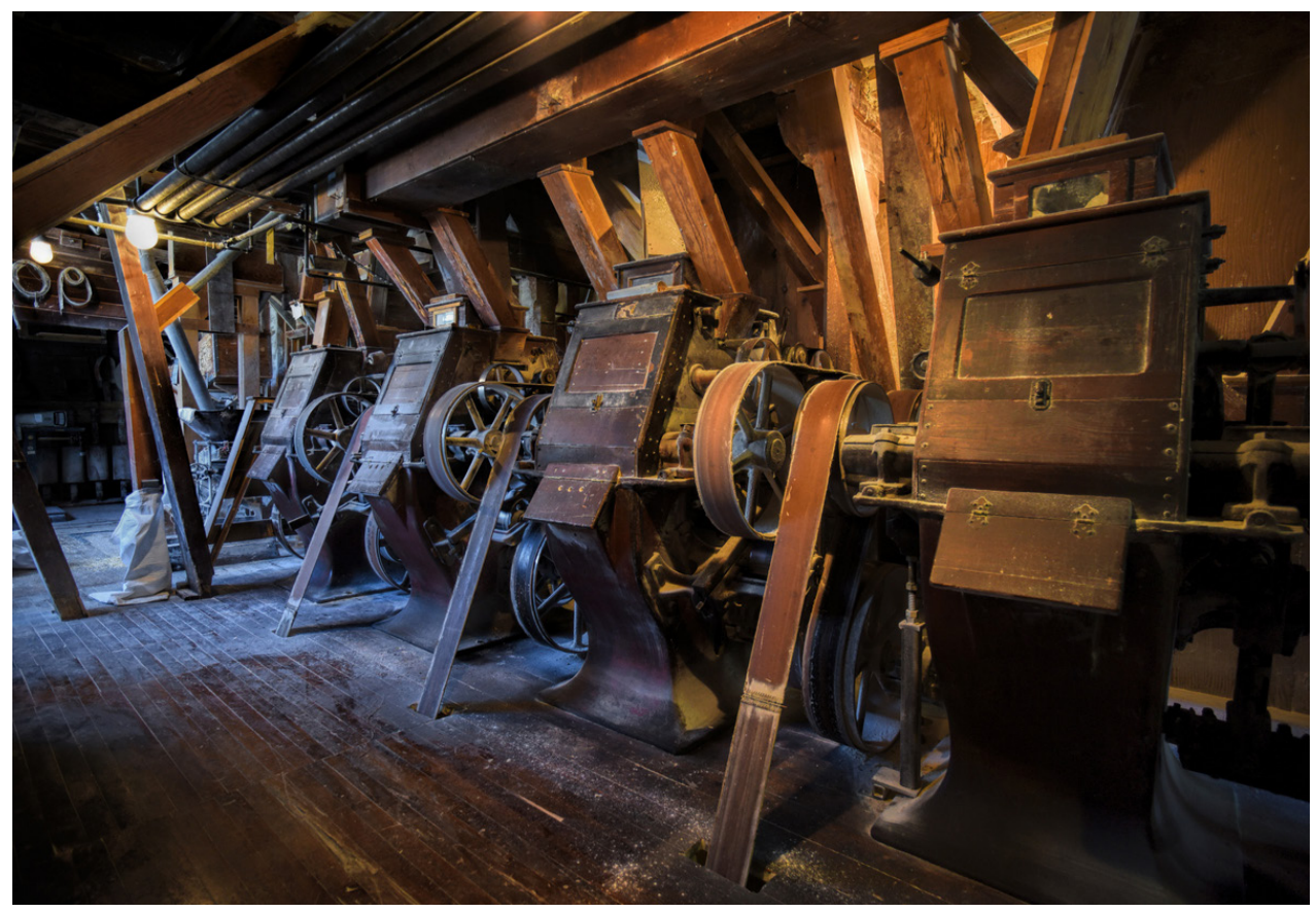
Roller bins in the Arva Mill used to ground wheat kernels into flour.

Official Journal of The London and Middlesex Historical Society