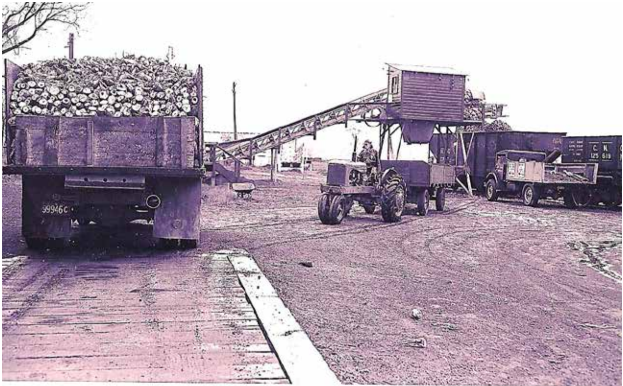
A farmer has just come off the scale at Ilderton, Ontario. He is waiting his turn at the conveyor. We are at another station on the former London, Huron and Bruce Railway. In this photo there is a war surplus 1500cwt vehicle near the tracks. The photo was taken October 27, 1950.