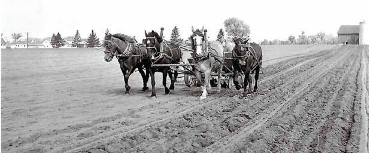
It was difficult trying to find a photo of farmers seeding; in this photo we are at the Ontario Hospital for the Insane. A four-horse team is seeding the field, the photographer is looking in a northwesterly direction towards the intersection of Highbury Avenue and Oxford Street. The photo was taken on May 19, 1952.