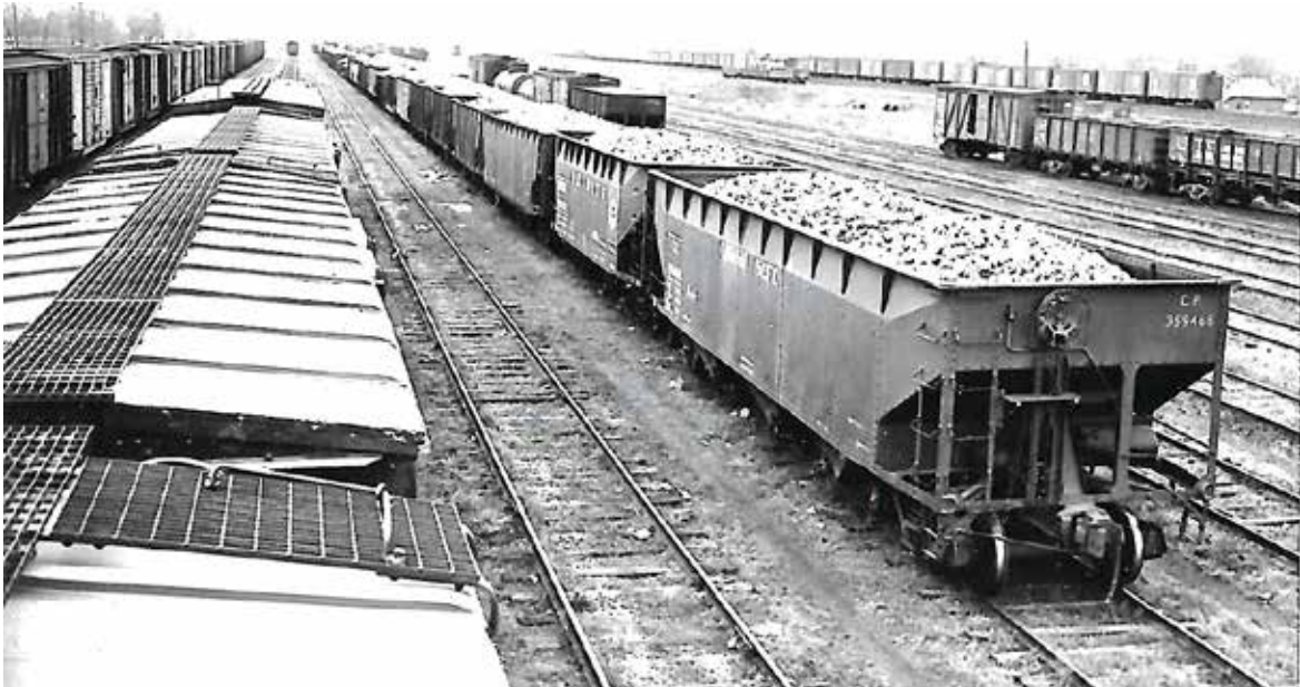
After arriving at London's CNR yard railway cars from Ilderton, Lucan and Granton will be assembled into a train. The train's destination will be The Canadian and Dominion Sugar Company processing plant at Chatham, Ontario. The photo was taken October 31, 1949.