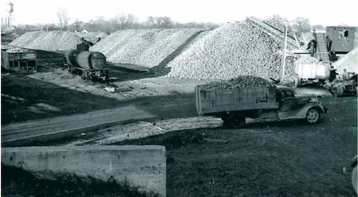
Upon arrival at Chatham, Ontario the Canadian and Dominion Sugar Company locomotive will take the train to a site where the sugar beets can be unloaded. Such a site was located at Wallaceburg, Ontario where the piles of sugar beets could measure fifty feet wide, thirty feet high and one thousand feet long. The photo was taken November 17, 1950