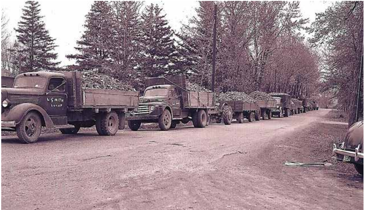
Getting towards the end of sugar beet harvesting season, farmers are lining up their trucks. They are waiting to unload at the railway facility at Lucan, on the former Grand Trunk mainline. The photo was taken November 17, 1950.