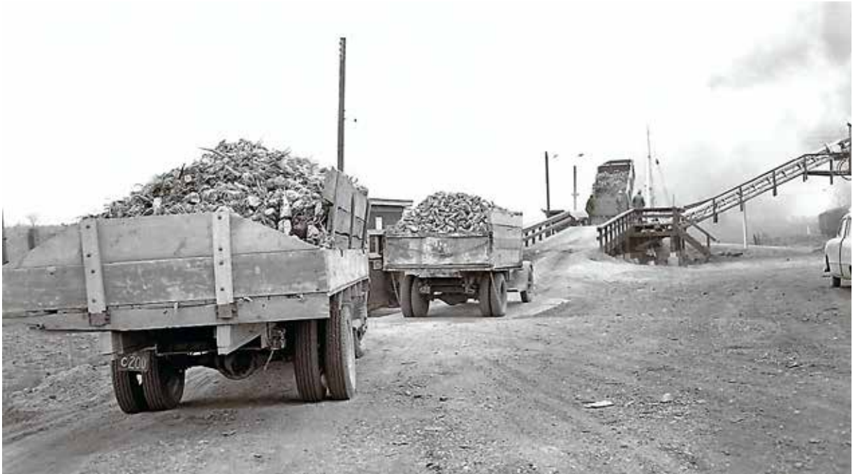
At Lucan, Ontario, trucks are lining up to unload their load of sugar beets. The unloading facility is on the former Grand Trunk mainline. The photo was taken October 24, 1950.