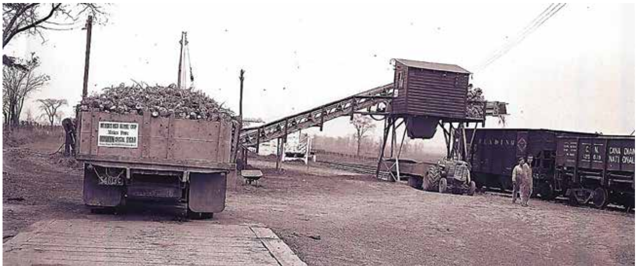
A tractor and farm trailer have been positioned under the loading facility. The trailer will receive dirt and weeds that got into the farmer's load. Also, in this photo we see hopper cars and general service gondola cars; these are the main type vehicles used to transport sugar beets.