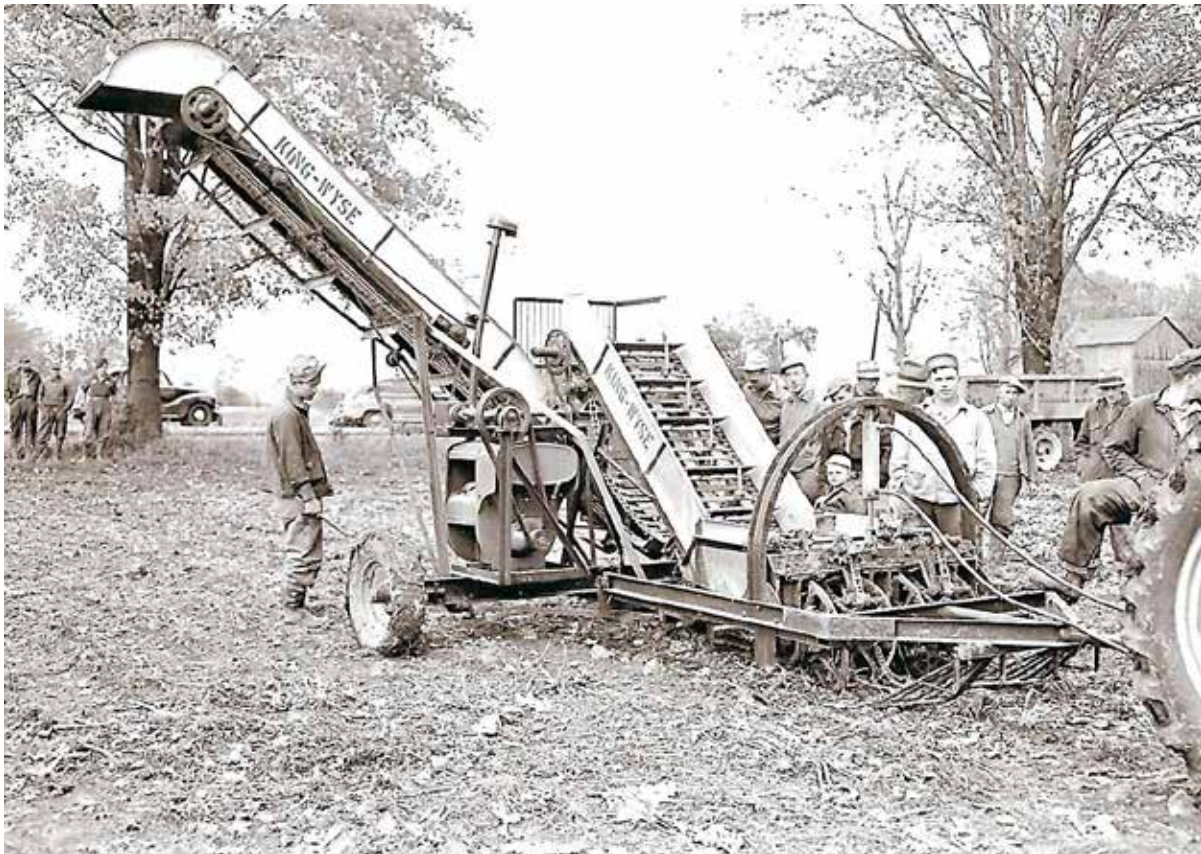
Somewhere in Middlesex County the London Free Press sent a photographer out to shoot the latest sugar beet harvester. Sugar beets were a labour intensive crop; harvesting began in the fall. The photo was taken October 10, 1950.